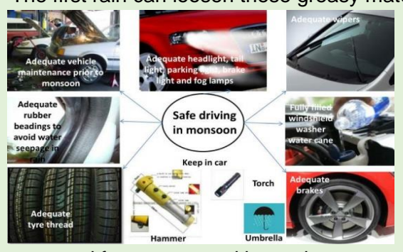
prepared for unexpected hazards.